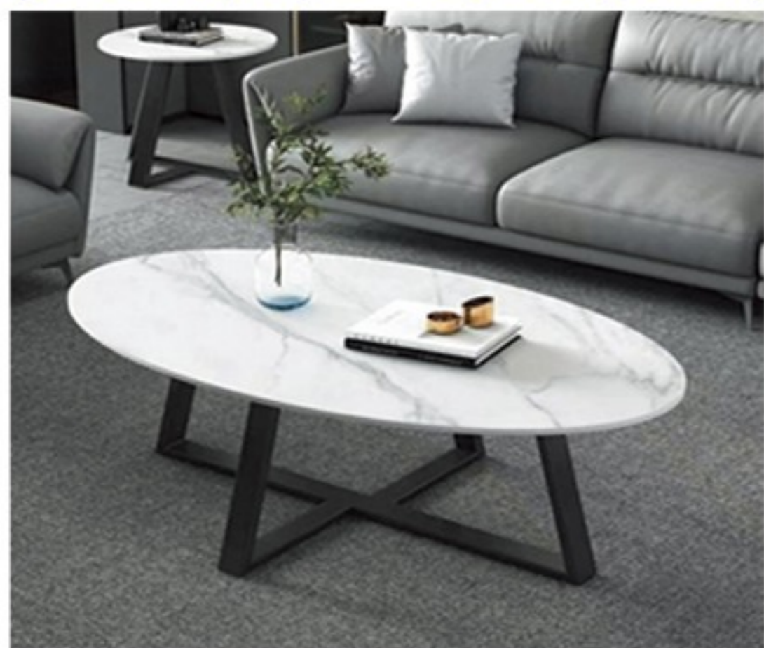
茶吧桌A款 Tea Bar Table Model A