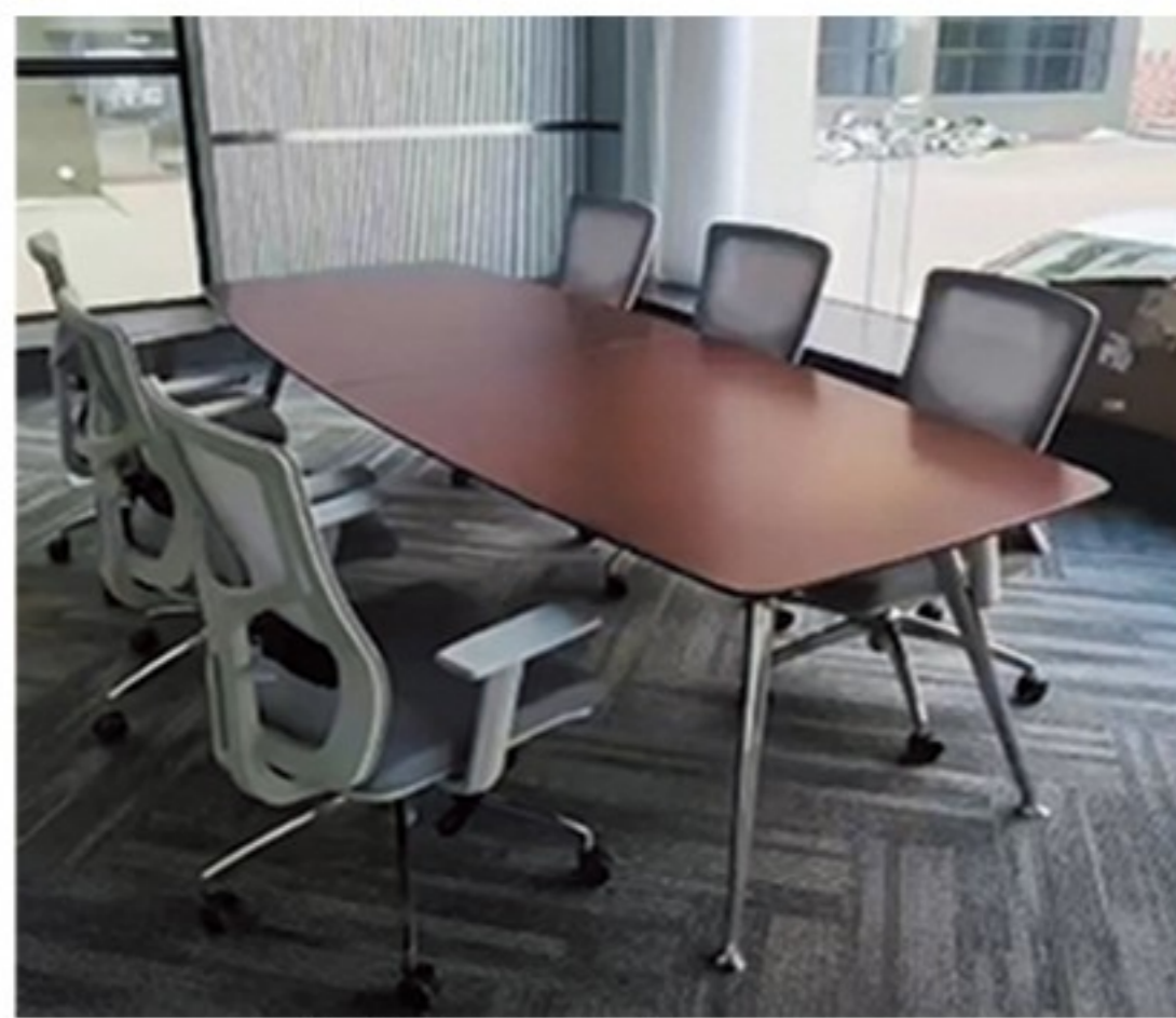
会议桌A款 Conference Table Model A