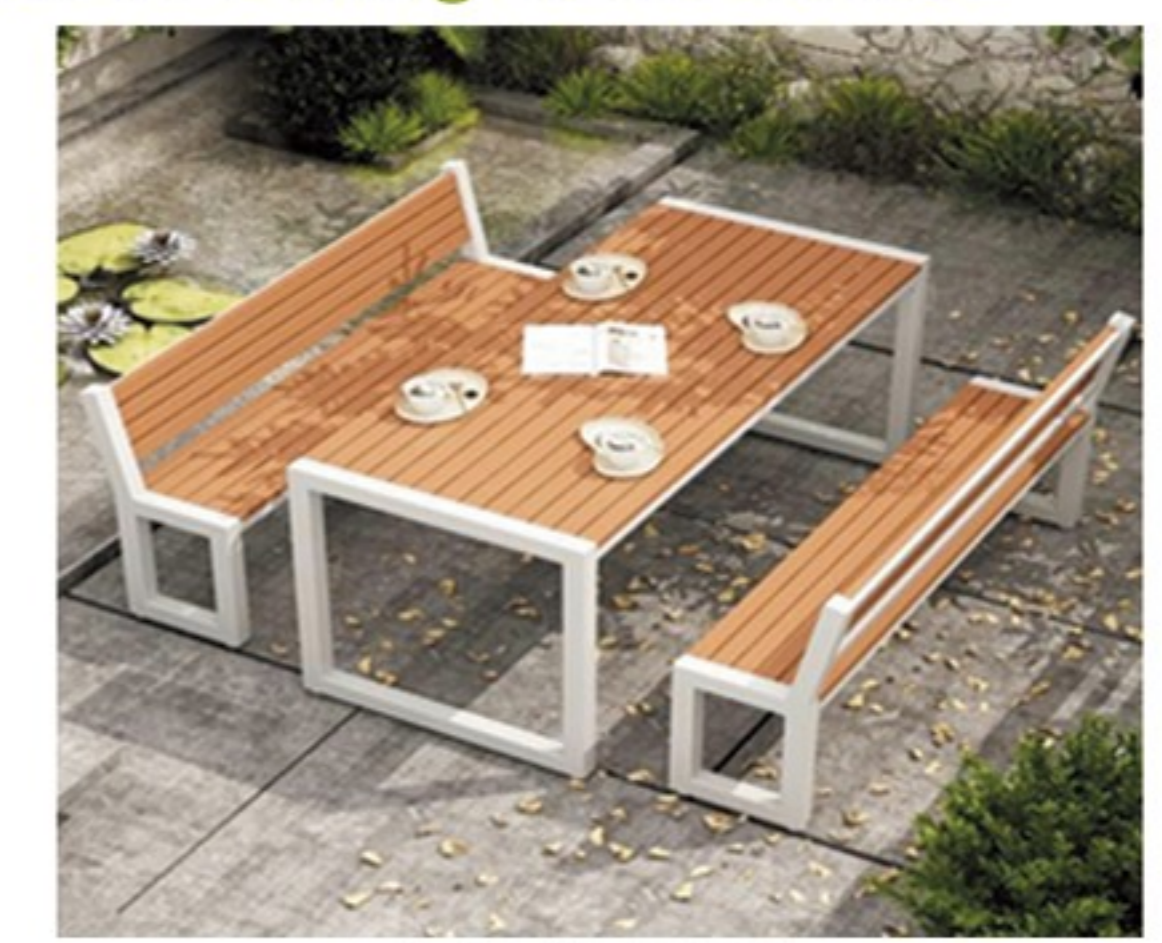
户外餐桌B款 Outdoor Dining Table Model B