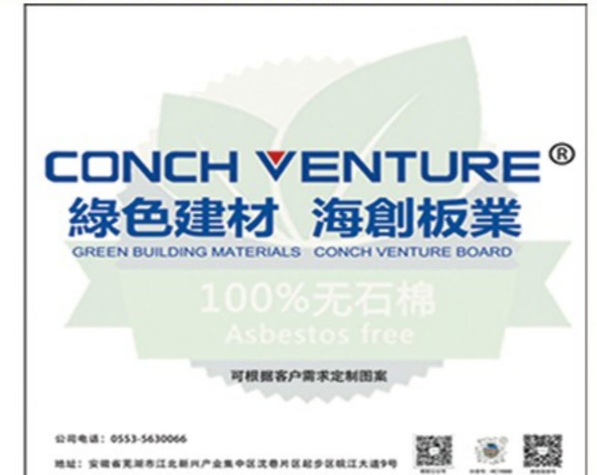
桌面可根据客户需求定制生产 The desktop can be customized according to customer needs