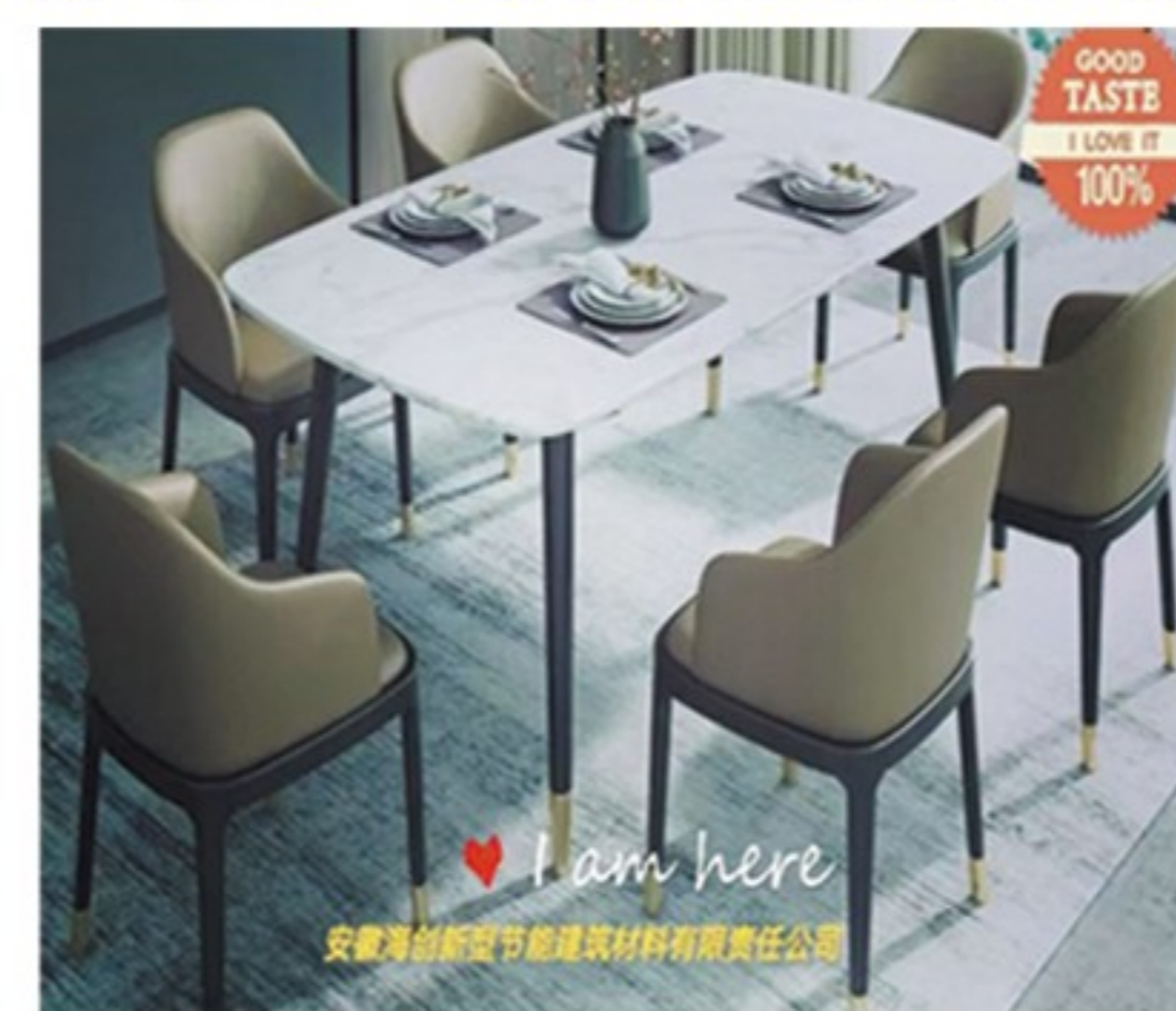
餐桌A款 Dining Table Model A