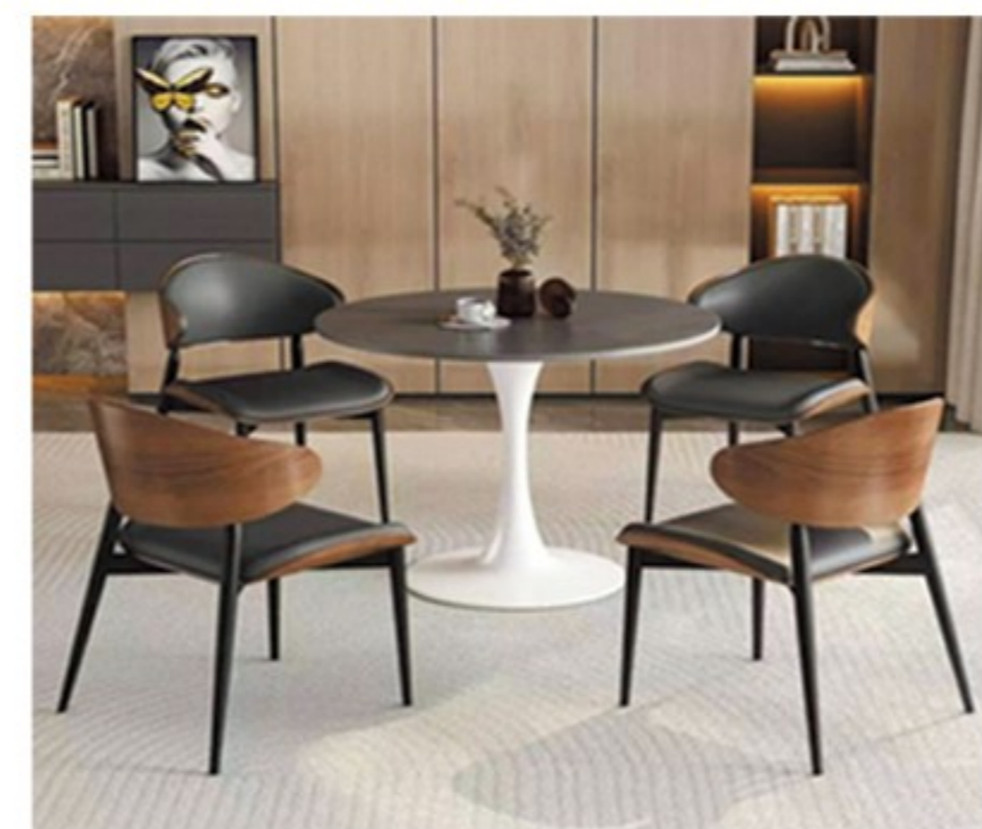
茶吧桌B款 Tea Bar Table Model B