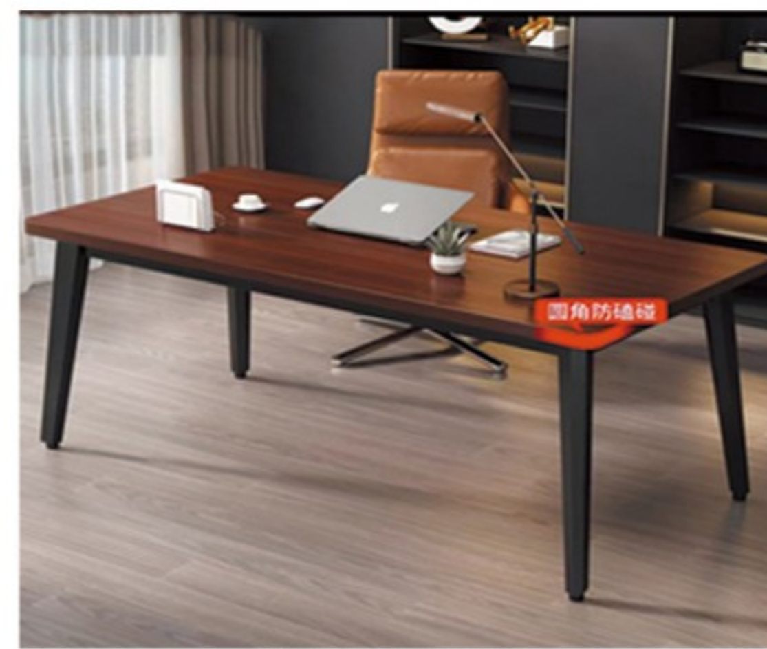
电脑桌B款 Computer Desk Model B